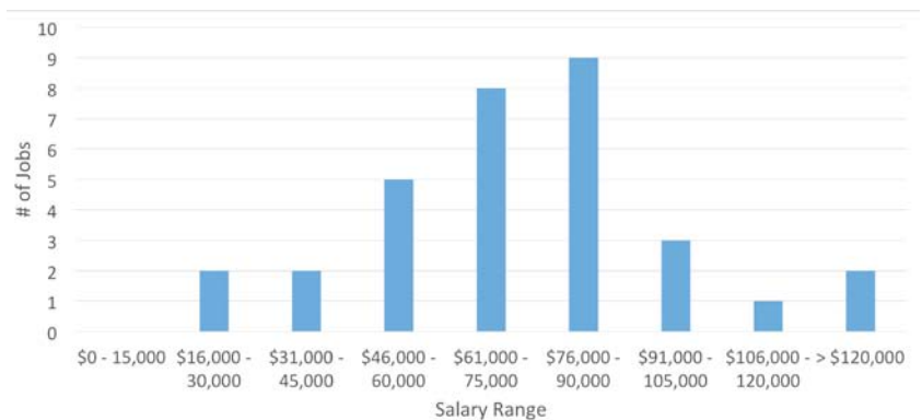
Figure 2. Distribution of global health jobs based on salary range.