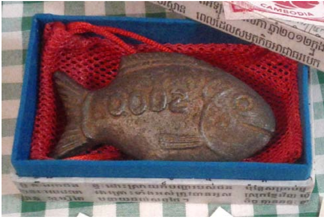
Photo: A Cambodian Lucky Iron Fish, which is added to cooking water to reduce iron deficiency.

can be used to objectively compare outcomes between countries. In this context, productivity can be defined as the efficiency of adults in the workplace, with Gross Domestic Product (GDP) used as the unifying unit to compare the effects on adults with ID to those with normal iron status. Although most data are mathematically derived due to variations in data collection in less developed countries, this is still important in understanding some of the long-term effects of ID.