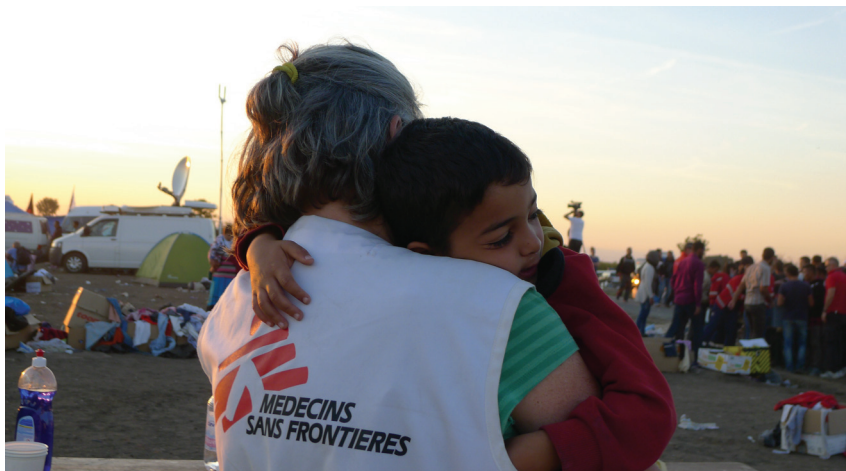
Photo: Médecins Sans Frontières assists Syrian refugees in Roske, at the Hungary-Serbia border. Among the refugees arriving in Europe, half of them are children.

Unfortunately, this cost-effective strategy has not been routinely implemented in low-income and middle-income countries, because of the structural weaknesses of their health systems.