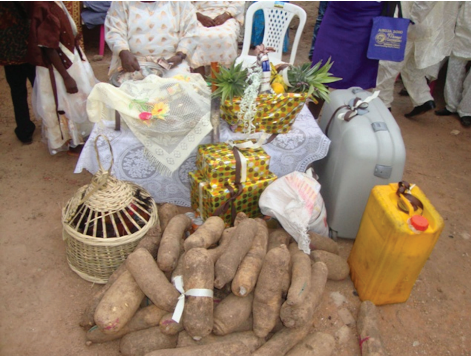
Photo: Vegetables, fruit and chicken for sale in a market in Ogbomosho, South-Western Nigeria.

With technological advances and the above-mentioned matters being resolved, modern techniques (metabolomics, proteomics, transcriptomics, genome-wide association study [GWAS] and epigenome-wide association study [EWAS]) offer exciting opportunities to enhance our understanding of the dysregulation of cellular metabolism in cancer and the roles of dietary, lifestyle and environmental exposures in modulating cancer processes. Their large-scale application at a population level requires technological (eg, stable high throughput methods, bioinformatics), logistical (eg, appropriate biological samples), and statistical (eg, sufficient study power) resources. In order to facilitate the translation of such methodologies to population studies, priority should be given to the development of standardized technology for appropriate collection and long-term storage of biological samples, particularly blood and DNA, tumor specimens, associated normal tissue, urine and hair. In addition, strategies for implement-