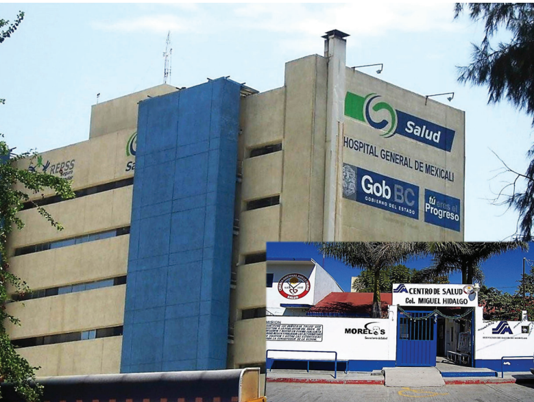
Photo: The difference infrastructure for curative care vs. primary care in Mexico. Courtesy of the author.