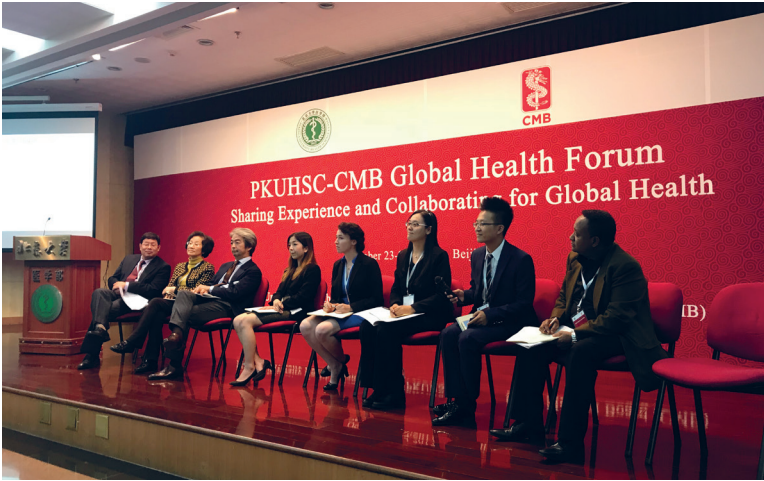
Photo: Global health experts meeting in Beijing, 2017.

with Dr Tedros Adhanom Ghebreyesus, Director General of WHO, in August 2017. Results from the discussion among domestic and international experts on the panel revealed that China may prioritize “its own” innovative collaboration - for instance South-South collaboration and Belt and road initiative - over the so-called conventional methods’ routinely exercised by WHO, GAVI and Global Fund.