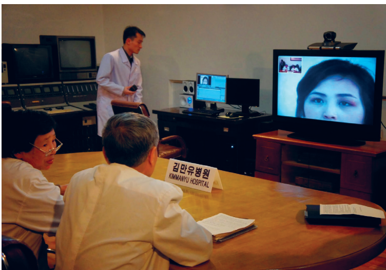
Photo: DoDaum's Telemedicine Initiative in North Korea.

First, research communities must explore sustainable models of telehealth programs that can become integrated into existing health care systems. While increased emphasis on effectiveness and cost-effectiveness research would facilitate the uptake of telemedicine by informing policies and investment decisions, this should not be the only approach. Although supply-induced innovation of telehealth has led to diverse programs, there has not been critical investigation into how