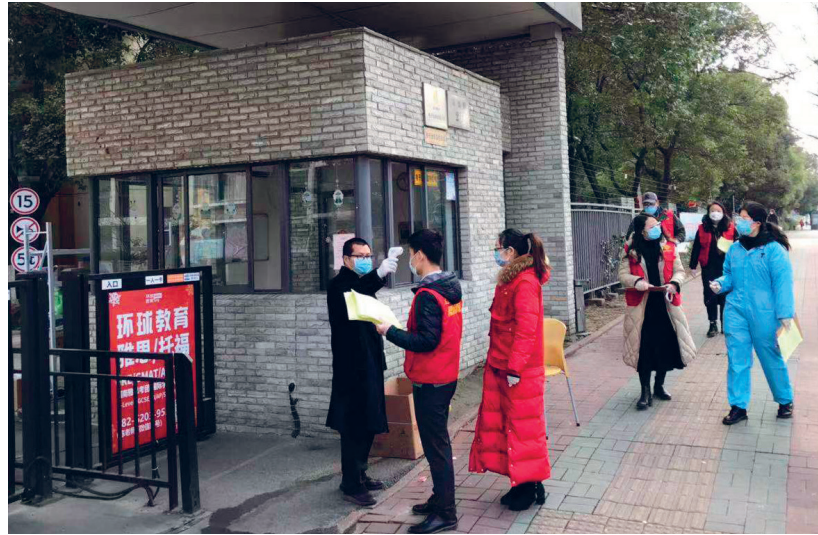
Photo: entry screening in a Chinese community (from the collection of one of the co-authors, used with permission).

and control of novel coronavirus, and responsibility for violating relevant laws and regulations shall be assumed. In order to better improve and implement the epidemic law, the following practices can be learned from China.