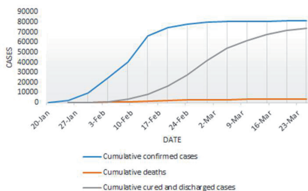
Figure 1. Trends of cumulative confirmed, dead, cured and discharged cases in China.

Facing the severe situation brought by COVID-19, China's government has adopted a series of strict prevention and control countermeasures, which have effectively controlled the spread of the epidemic in China and have gained time for the prevention and control of COVID-19 for the other countries. According to the daily outbreak data released by the National Health Commission of China, from the national point of view, the mortality rate of patients has been declining, and the proportion of patients with severe illness has been decreasing. The trend of cumulative cases in China is shown in Figure 1 and the trend of new cases in China is shown in Figure 2 .