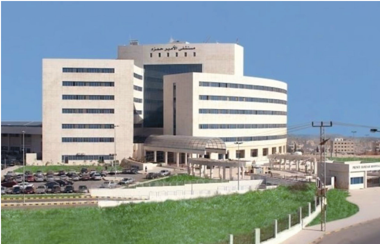
Photo: COVID-19 isolation center in Jordan – Prince Hamzah Hospital.

cases were registered daily at variable rates with the highest number registered on 26th March with 40 new cases and the lowest number of 0 cases registered on 10th April 2020 [5]. One more COVID-19 case recovered on the 26th March with a variable number of cases recovering daily afterward. The first death case due to COVID-19 was registered on 28th March (Table S1 in the Online Supplementary Document ). The epidemiological status of COVID-19 was changed from imported cases to local transmission on 26th March 2020 [1].