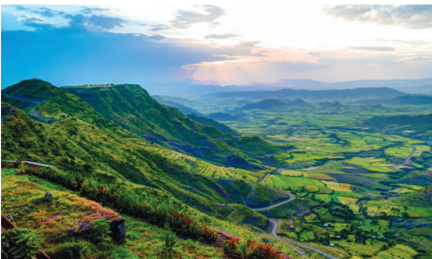
Photo: The landscape and context of Ethiopia.

The focus group discussion identified 30 possible contributors to the status of the epidemic in Ethiopia. These possible contributors were then categorized into four potential explanatory interpretations (see Table 1 ). Each explanatory interpretation was tested against current evidence identified in the literature, as summarized below.