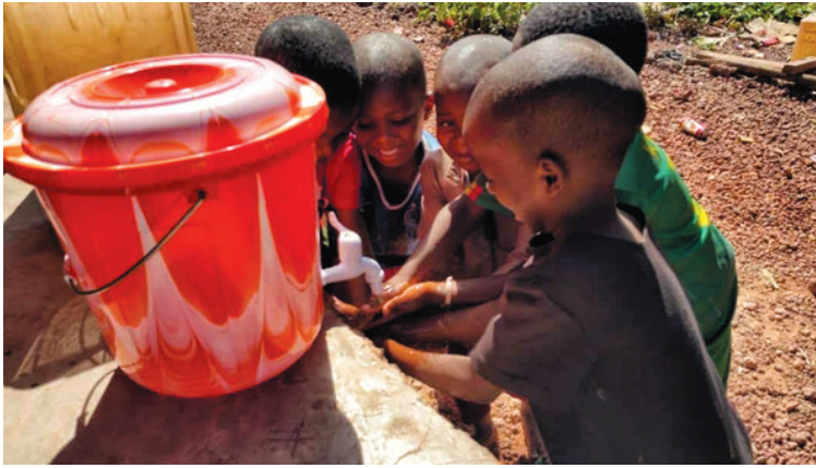
Photo: Children learning to wash hands before eating, as a practical part of a prevention program for hygiene promotion (from the authors' own collection, used with permission).