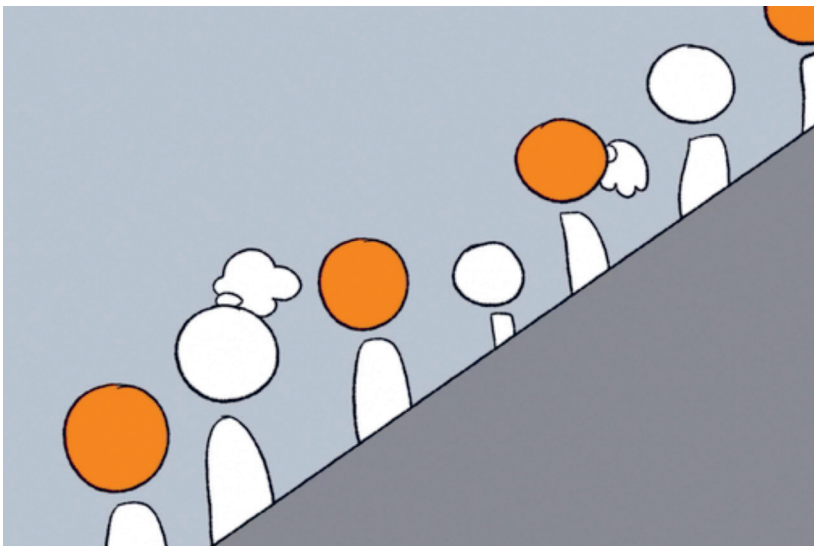
Photo: Scene from a wordless, globally scalable COVID-19 prevention animation. Available on YouTube

We designed a simple storyline to convey the priority health messages. We gathered rapid feedback on a set of simple, culturally agnostic characters to convey the primary routes of viral spread and the main preventive strategies. When deciding on the tone of the video, we weighed the desire to reassure viewers with the need to underscore the seriousness of the pandemic, especially given media reports of young adults around the world ignoring public