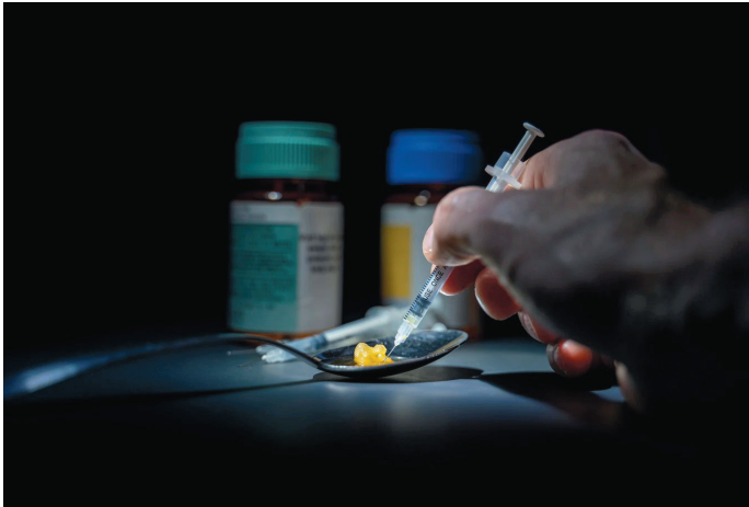
Photo: COVID-19 vaccine uptake in substance use disorder patients is challenged by the structural and financial barriers to vaccination centres.

tions. The blood-brain barrier (BBB) loses its integrity and undergoes cytoskeletal remodeling. With the increased permeability of BBB, neuroinflammation and SARS-CoV-2 invasion can lead to brain edema and degeneration [1,6]. Components of synthetic cannabinoids and marijuana activate CB1R in the brain, and cannabinoid receptors in the myocardium, vascular endothelial cells, and smooth muscles of the heart. This results in stroke, COPD, and arrhythmia which are associated with predisposing risk factors of COVID-19 [1].