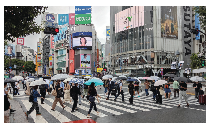
Photo: Shibuya Scramble Crossing, Tokyo (from the fourth author's own collection, used with permission).

idemic and the response of the health care system in Japan have unique characteristics. This is particularly evident in declaring states of emergency during peaks with non-compulsory self-restraint requirements, the low mortality rate, the sharp decline in the number of cases after the impact of the Tokyo 2020 Olympic and Paralympic Games on the health care system, and the unprecedented rise in the number of infections due to the current spread of Omicron variant (Figure 1).