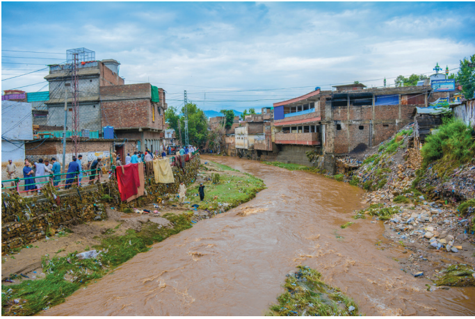
Photo: A scene from current floods in Pakistan.

need of humanitarian assistance. Communication, roads, and bridges in the south of Pakistan have been heavily damaged, which is hindering girls' and women's access to healthcare facilities, endangering them and increasing their vulnerability to abuse, violence, and neglect. Factors such as class status, caste, age, sexuality, race, ethnicity, religion, and nationality impact the safety of women in current floods and making them more vulnerable [2].